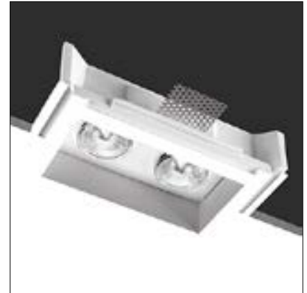
DOUBLE BEAM (BILIGHT)