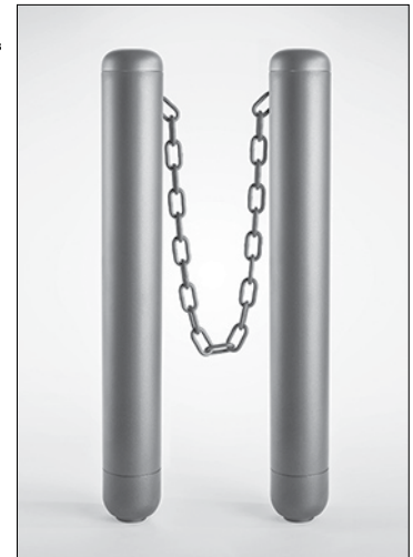
Fixture Dimensions Ø4.5" x 35.4" h