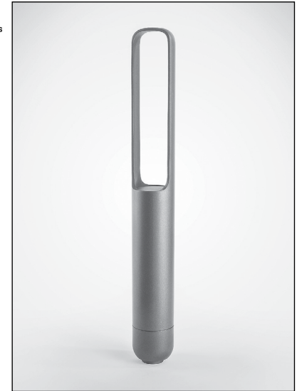
Fixture Dimensions Ø4.5" x 35.4" h