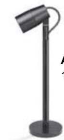
AC068 11.8" Extension Pole