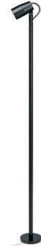
AC070 35.4" Extension Pole