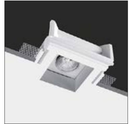
SINGLE BEAM (MONOLIGHT)