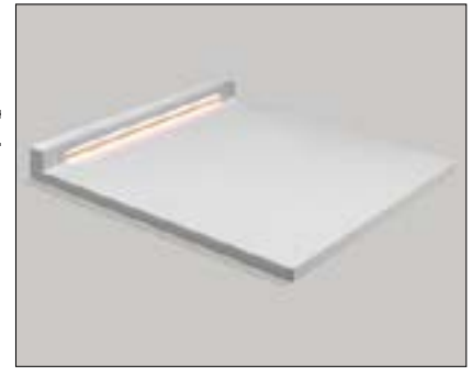
Fixture Dimensions 19.69" l x 19.69" w x 1.57" total height (tile is 0.79"h)