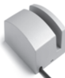
SIDE KNOCKOUT FOR CABLE