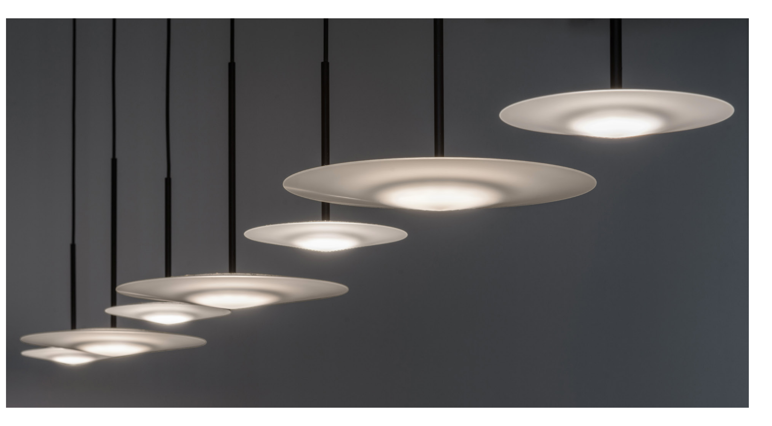
Cato Networks | Architecture: Roy David Architecture