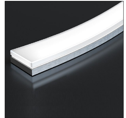
Fixture Dimensions - See page 2