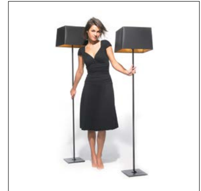
MEMORY READING & BIG