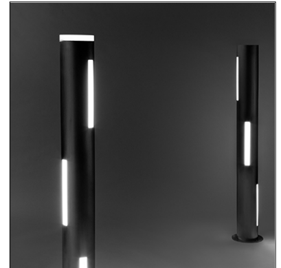
Fixture Dimensions - See page 2