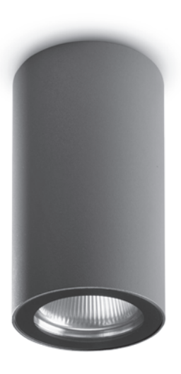
Anthracite Grey RAL 7016