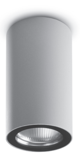
Textured Grey RAL 9006

... AND IT DOESN'T END THERE: TO ENSURE MAXIMUM VERSATILITY AND THE MOST SATISFYING USER EXPERIENCE POSSIBLE, CYLINDER IS AVAILABLE IN THREE DIFFERENT FINISHES (TEXTURED GRAY, ANTHRACITE GRAY AND MATT BLACK) OR YOU CAN REQUEST A CUSTOMISED FINISH TO SUIT YOUR PLACEMENT NEEDS BETTER!