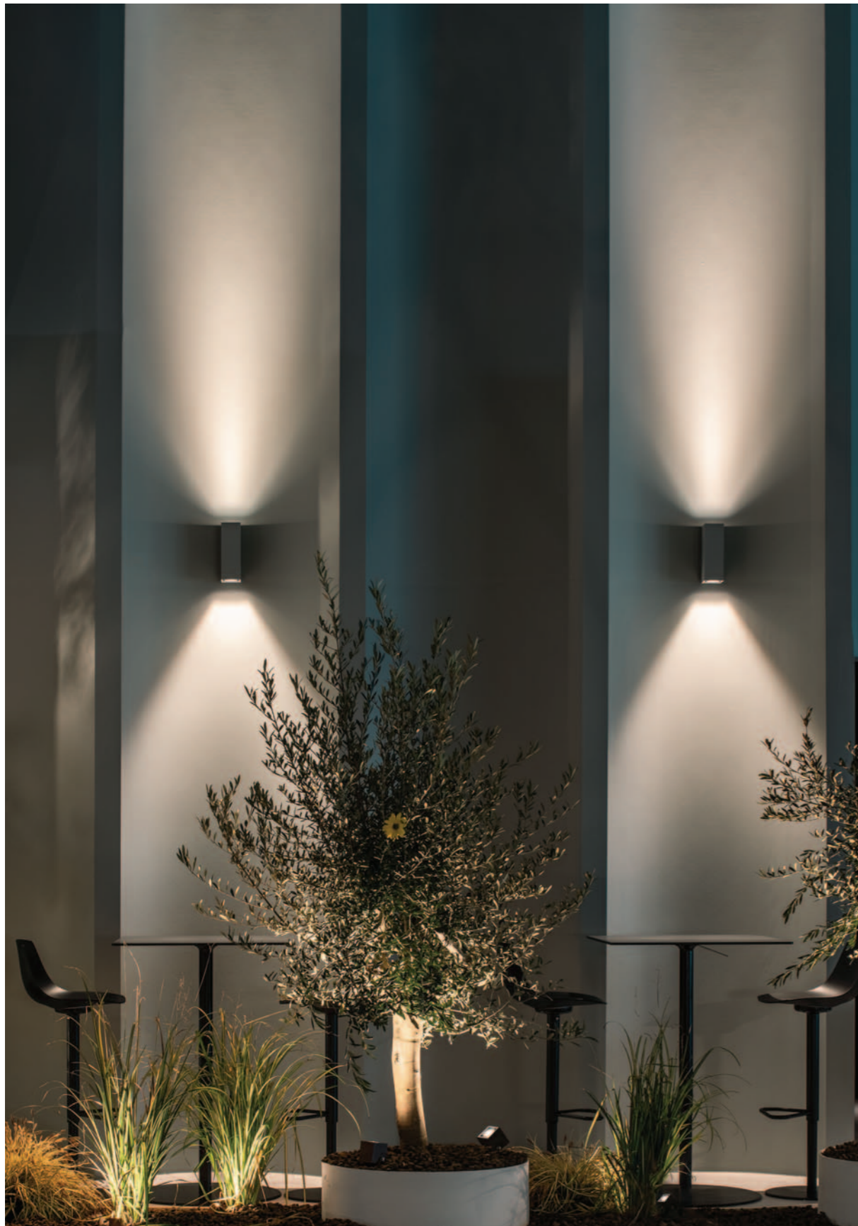
Metope 3.2, 3000K , 19W, 16°+54° , primer.