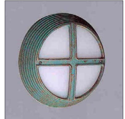
Fixture Dimensions See Chart and Drawing on page 2.