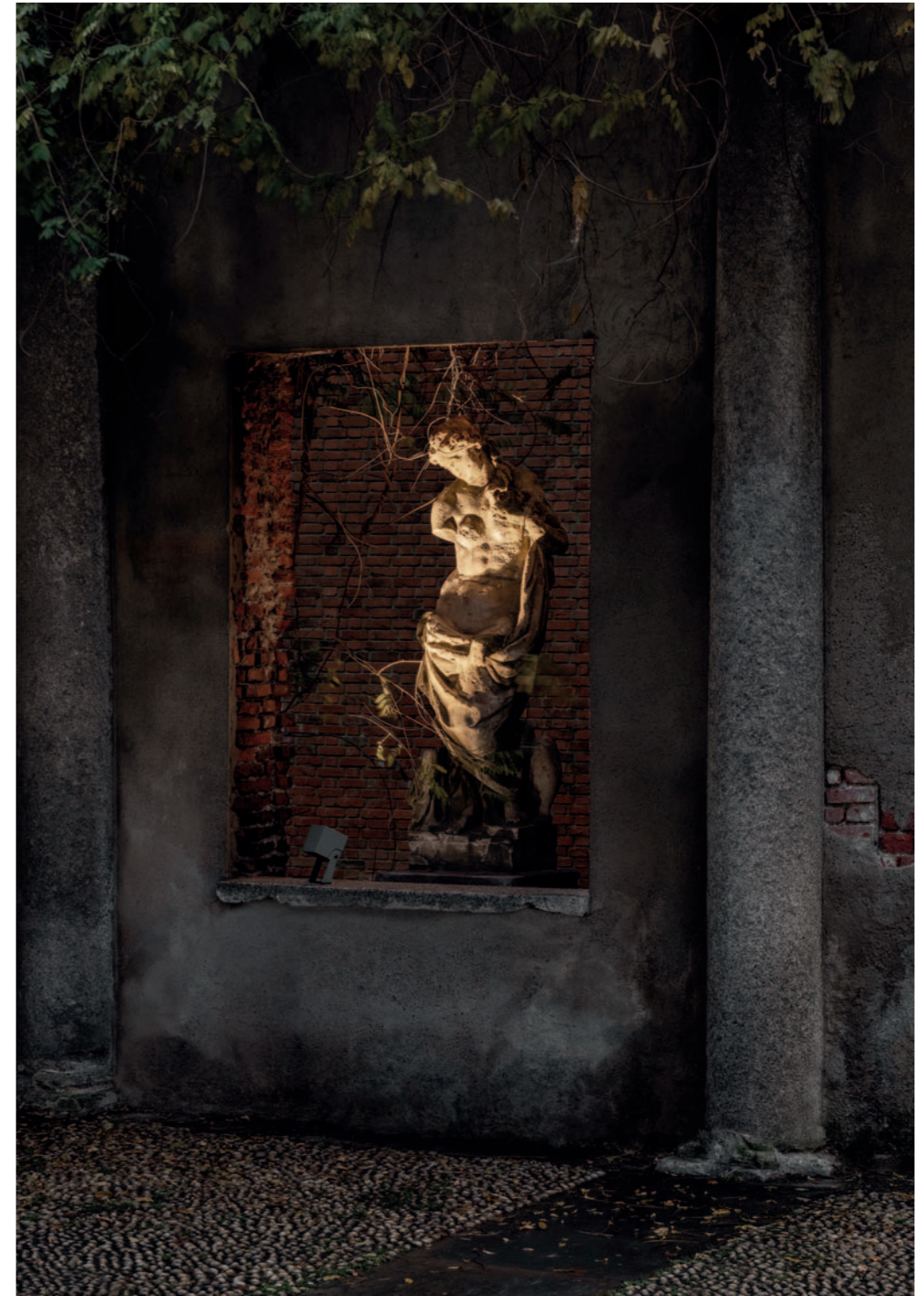
Reiko 4.0, 3000K, 25W, sharp 33°, grey.

Wide choice of optics for different lighting concepts