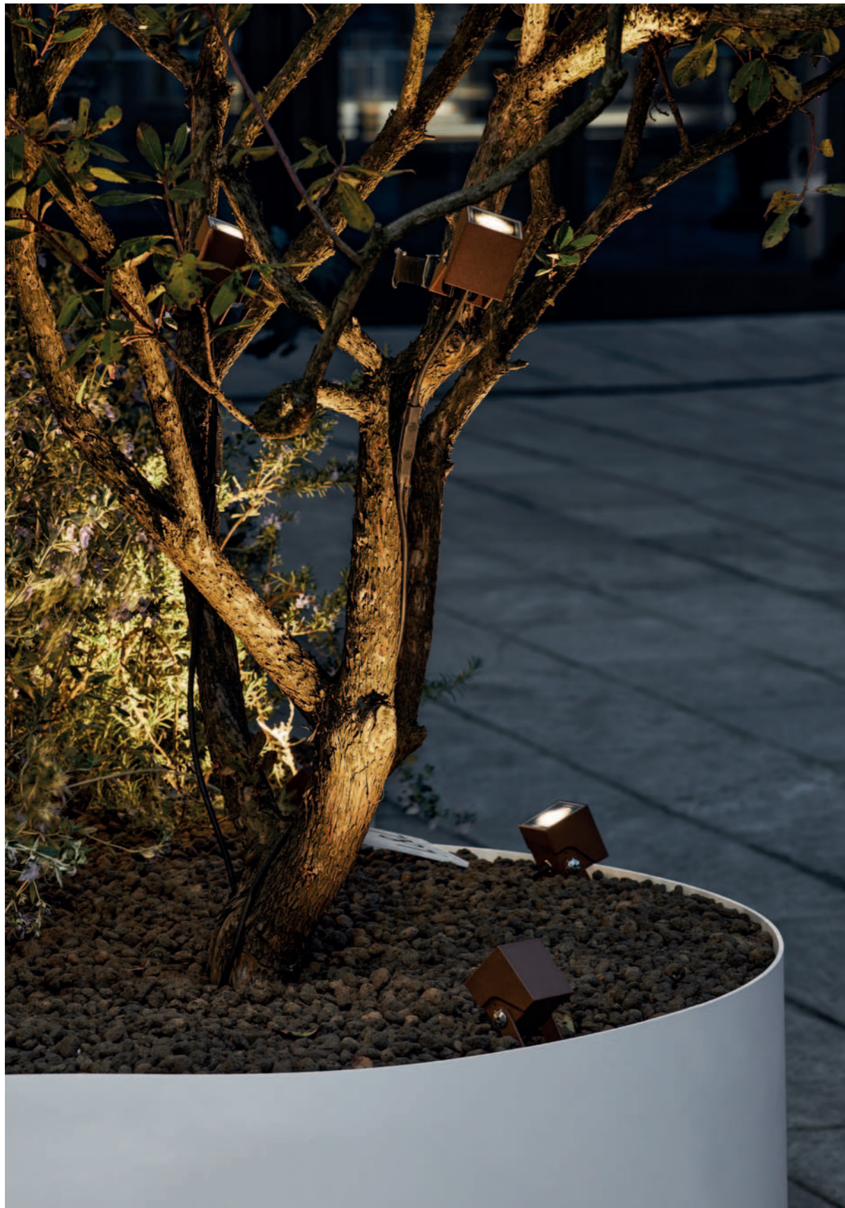
Reiko 2.0, 3000K, 7W, 44°, cor-ten. Reiko 1.0, 3000K, 3,5W, 38°, cor-ten.