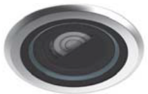
AC117 Glare Shield for Cielo Mini