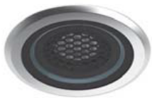
AC116 Honeycomb Louver for Cielo Mini