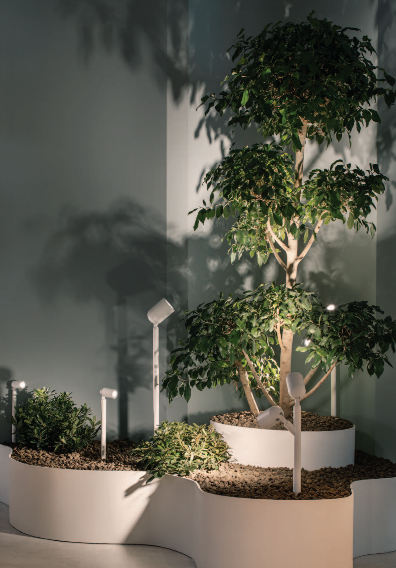
Pivot B 3.9, 3000K, 25W, optical range 15°-38°, white, with spike. Pivot B 2.9, 3000K, 14W, optical range 1°-43°, white, with dual-fixture spike. Pivot B 1.9, 3000K, 7W, 45°, white, with spike.

Unobtrusively enhance natural garden details