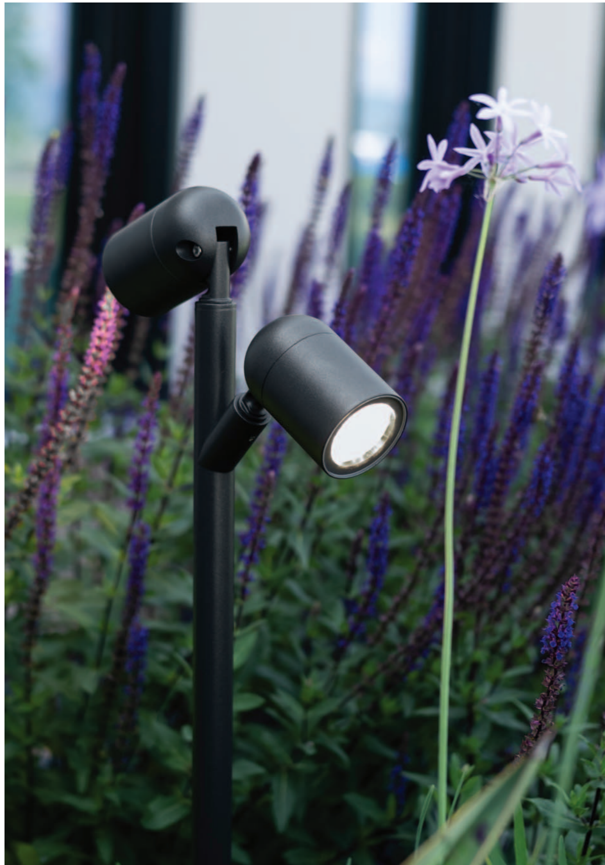
Pivot B 2.9, 3000K, 14W, optical range 15°—43°, anthracite, with dual-fixture spike.