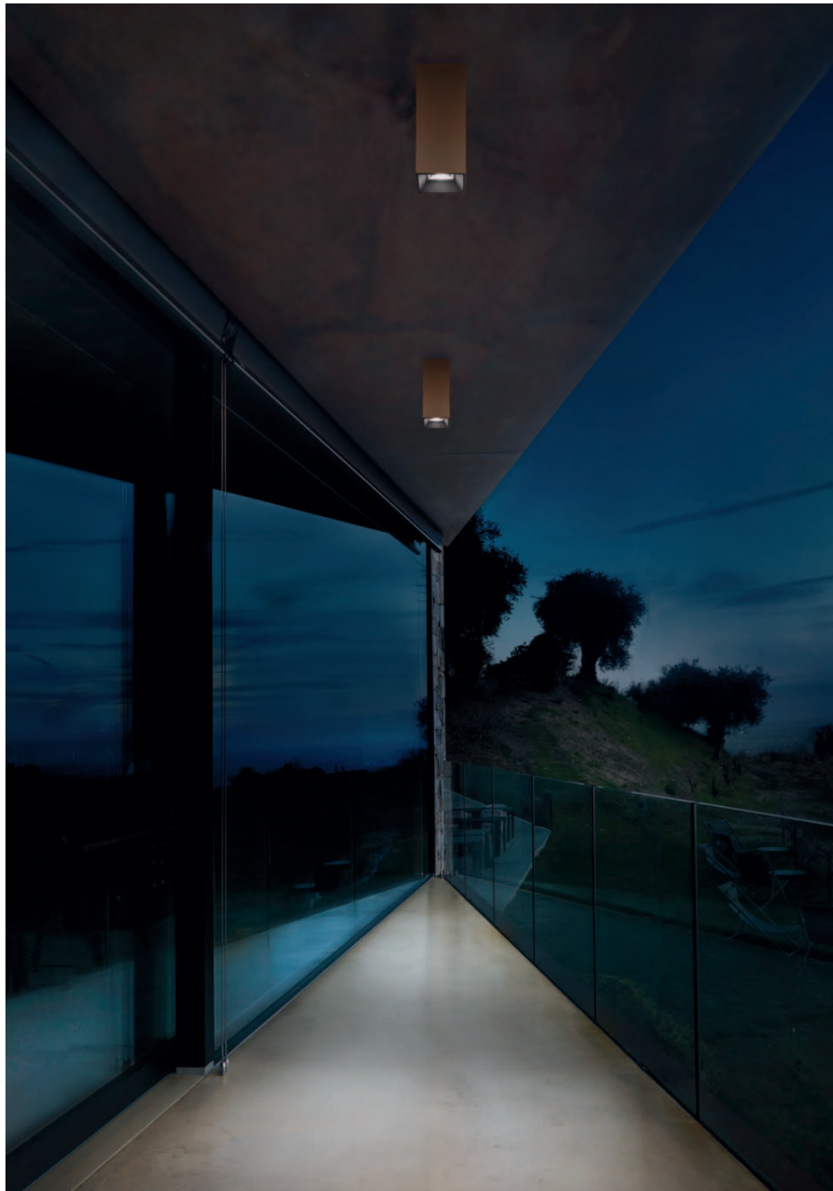
Altopiano C 1.1, 3000K, 8W, 50°, cor-ten.