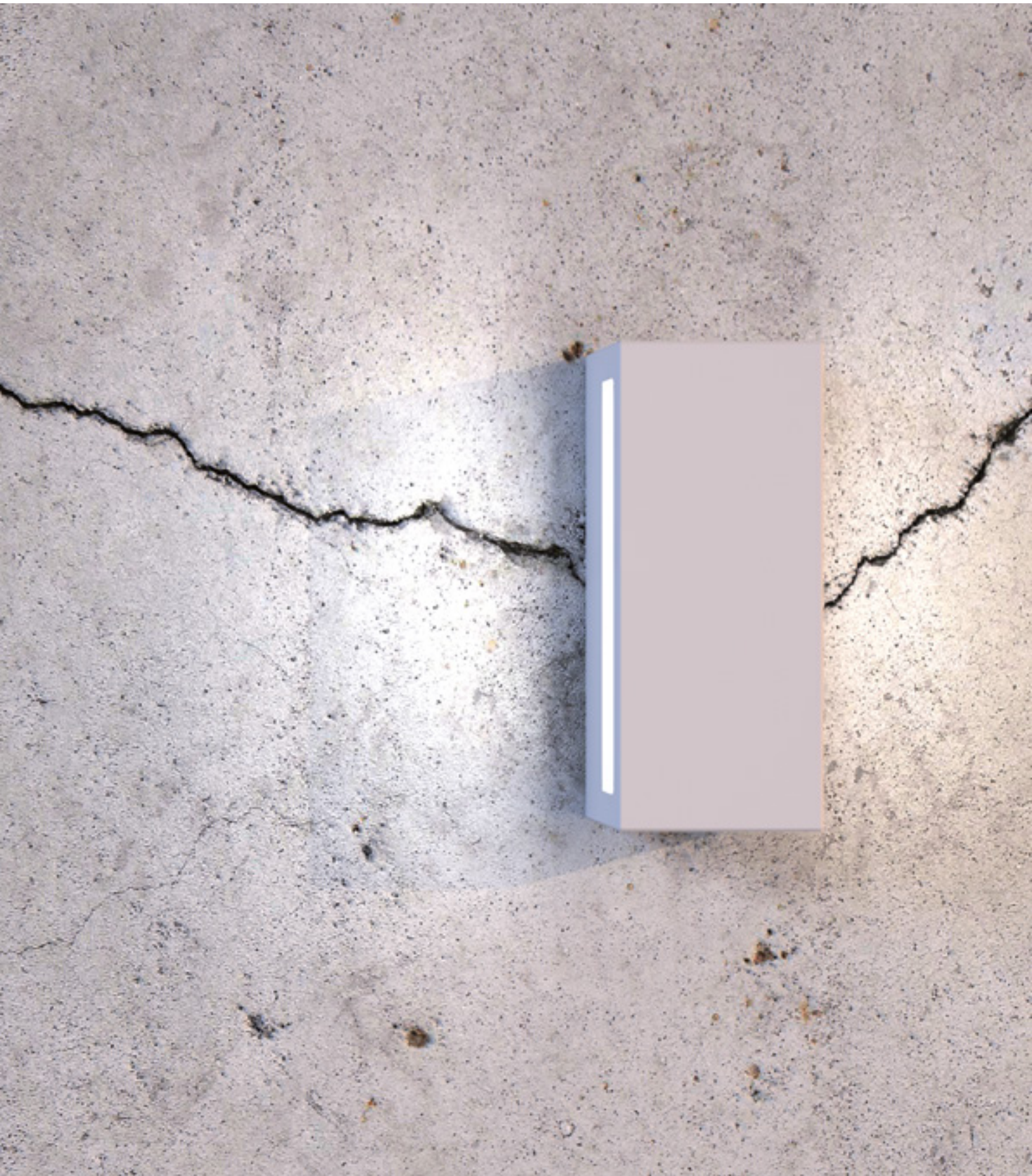
MATTER SHEDS LIGHT