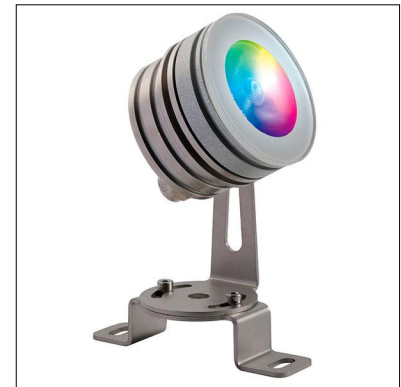
FLEA MAXI Underwater Spot RGBW PRO