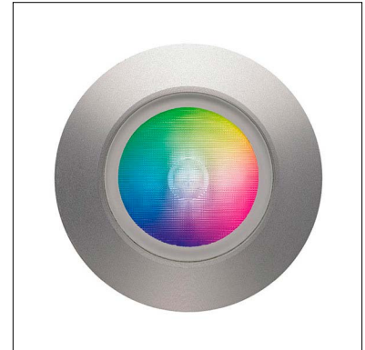
FLEA MAXI Underwater Round RGBW PRO