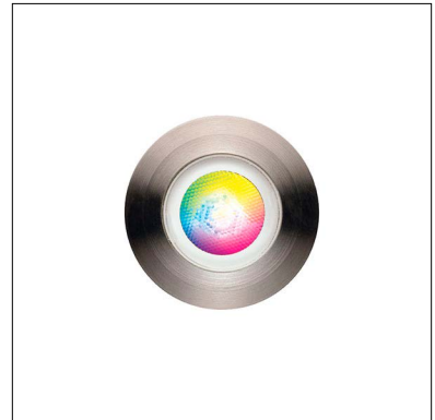
FLEA MINI Underwater Round RGBW