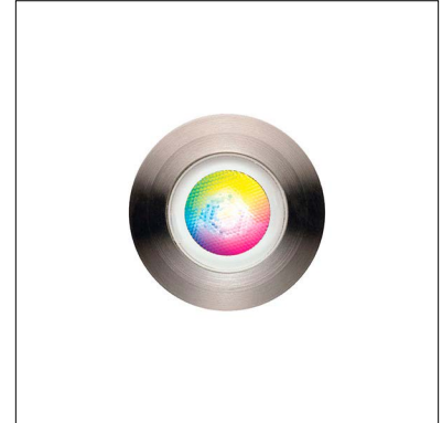
FLEA MINI Underwater Round RGBW