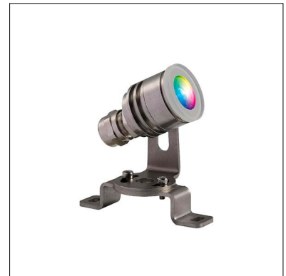
FLEA MINI Underwater Spot RGBW