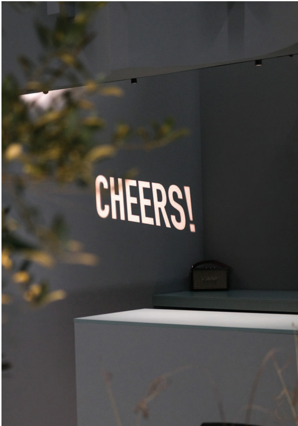
Krill Track 3.0, 3000K, 5.5W, 42°, black. Krill Track 4.5, 3000K, 10W, light shaper + gobo.