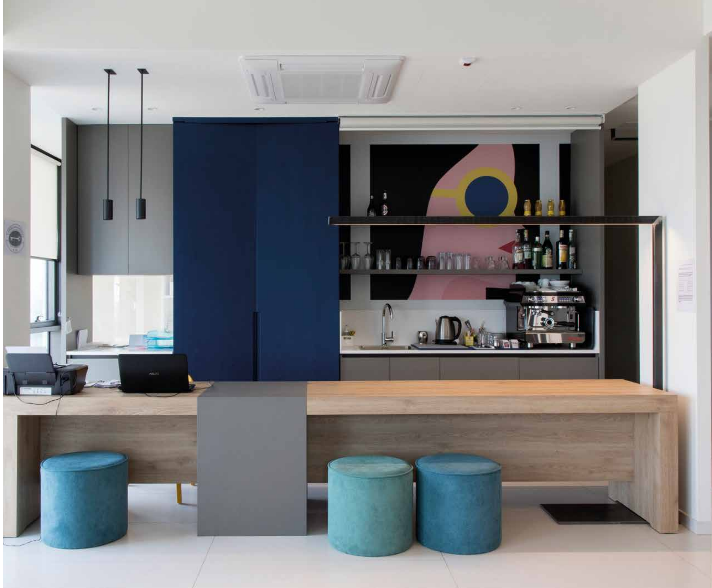
PIANO SOLO MAXI Project Silvia Ticchi App Sea View Hotel