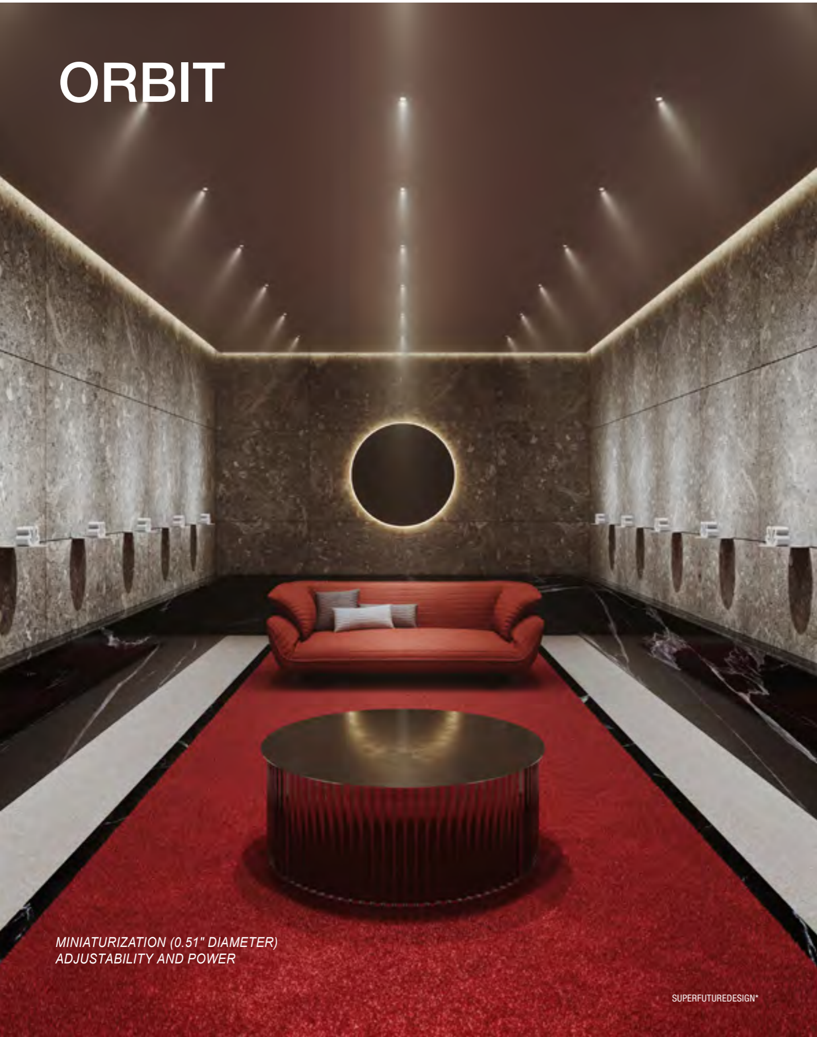
MINIATURIZATION (0.51" DIAMETER) ADJUSTABILITY AND POWER