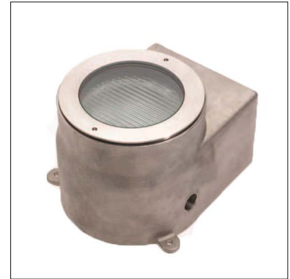
Fixture Dimensions Ø7.0" x 7.0" h See Full Drawing on page 2